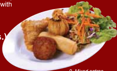
9. Mixed entree