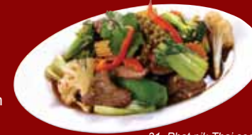
31. Phat pik Thai sod