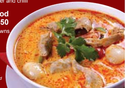
42. Gaeng ped

Grilled barramundi, prawns calamari and scallops simmered in a clay pot served with your choice of salad or rice.