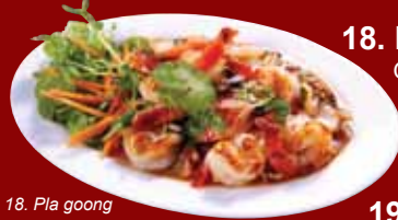
18. Pla goong